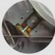
Volan Tahrirli Talaş Fırçası Swarf Brush