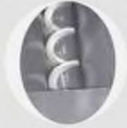
Helezon Talaş Konveyörü Spiral Swarf Conveyor