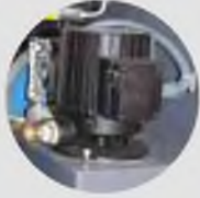
Soğutucu Pompası Coolant Pump