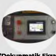
7" Dokunmatik Ekran & Kontrol Panel 7" Touch Screen & Control Panel