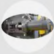
Hidrolik Şerit Gerdirme Hydraulic Blade Tensioning