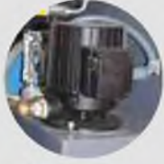
Soğutucu Pompası Coolant Pump