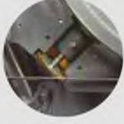
Volan Tahrirli Talaş Fırçası Swarf Brush