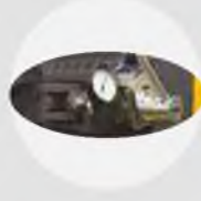
Hidro-Mekanik Şerit Gerdirme Hydra-Mechanic Blade Tension