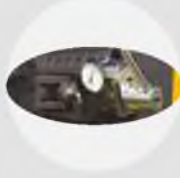
Hidro-Mekanik Şerit Gerdirme Hydra-Mechanic Blade Tension