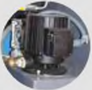
Soğutucu Pompası Coolant Pump