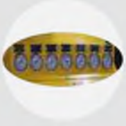
Basınç Göstergesi Pressure Display Manometer