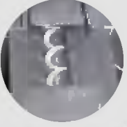
Helezon Talaş Konveyörü Spiral Swarf Conveyor