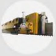
Hidrolik Elmas Sıkma Hydraulic Blade Guide