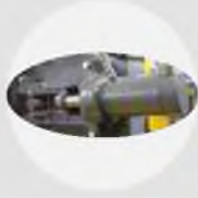
Hidrolik Şerit Gerdirme Hydraulic Blade Tensioning