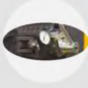
Hidro-Mekanik Şerit Gerdirme Hydra-Mechanic Blade Tension