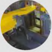
Sürme Sistemi Driving System