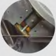
Volan Tahrikli Talaş Fırçası Swarf Brush