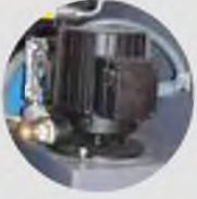
Soğutucu Pompası Coolant Pump