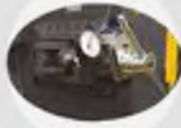
Hidro-Mekanik Şerit Gerdirme Hydro-Mechanic Blade Tension