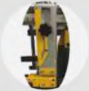
Hareketli Kol Movable Arm